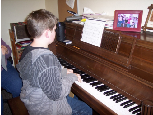
6th grade student learning sheet music for upcoming recital.

No music class is complete without the quintessential piano class. Diane Robertson starts her young students off